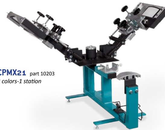
CPMX21 part 10203 2 colors-1 station