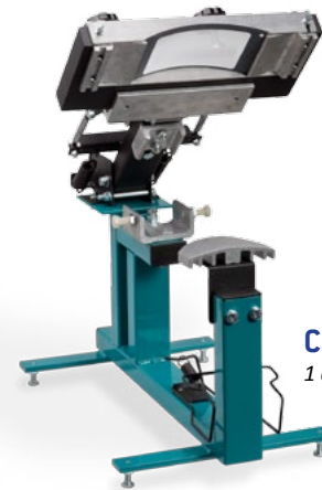
CPMX11 part 10204 1 color-1 station