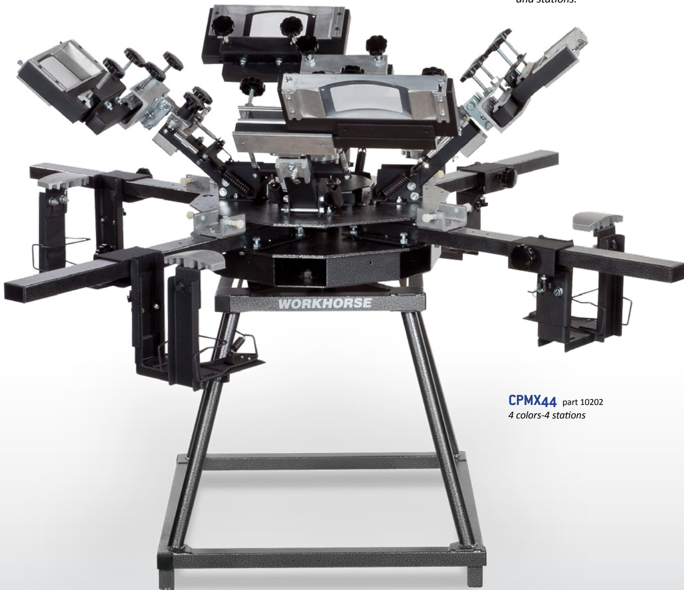
CPMX44 part 10202 4 colors-4 stations